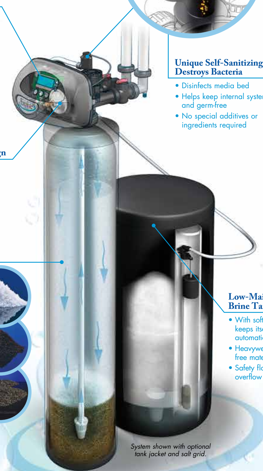
System shown with optional tank jacket and salt grid.